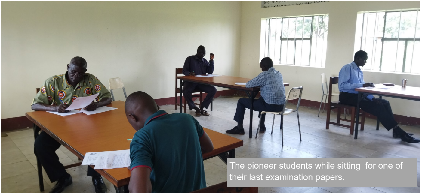
The pioneer students while sitting for one of their last examination papers.

The first batch of students pursuing Bachelor of Theology Degree at The Episcopal University of South Sudan, Kajo-Keji Christian College Campus has finally sat for the last examinations.