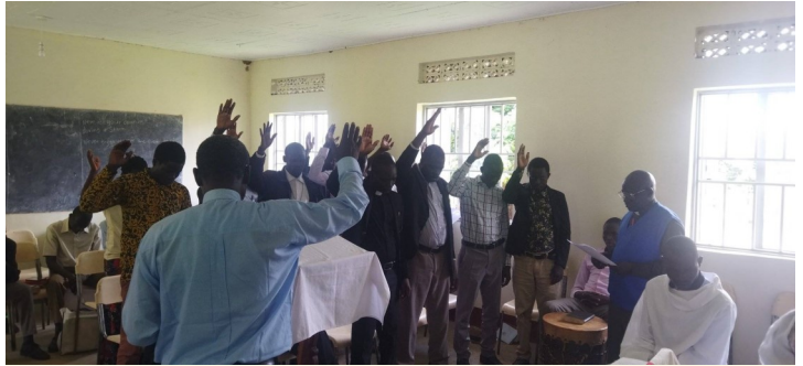
The Student leaders taking their oath to serve the college.

He encourages the guild leadership to work hard in their various roles.