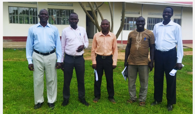
Some of the pioneer students take a memorable photo after finishing their exams.

He says he is ready to serve his community with the knowledge and skills he has gotten during the studies.