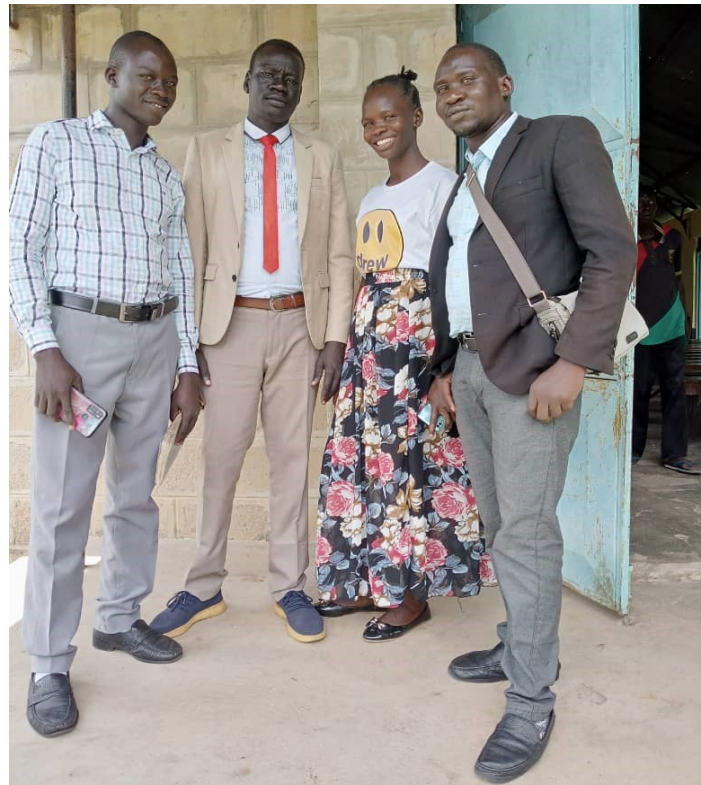
Practicum students in one of the parishes within Kajo-Keji

Notably, the practicum has also allowed students to acquire essential