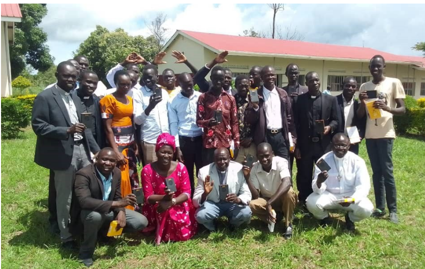
A group photo of club members after receiving their audio Bibles

The college believes that the ABBC will create a nurturing environment for students and the community to listen, learn, and grow in their faith. By gathering men, women, children, and even foreigners residing on our campus, we will foster a sense of community as we journey together through the Word of God.